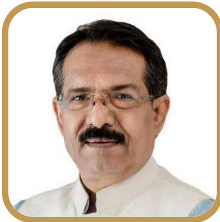
Shri Harsh Malhotra Hon'ble Minister of State for Road, Transport & Highways and Corporate Affairs