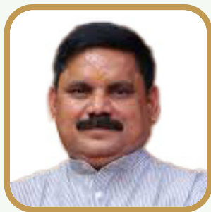
Shri Satish Chandra Dubey

Hon'ble Minister of Commerce and Industries