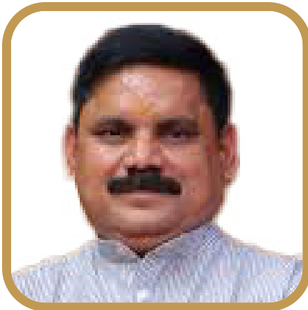
Shri Satish Chandra Dubey Hon'ble Minister of State for Coal and Mines