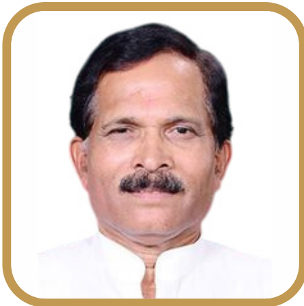
Shri Shripad Yesso Naik Hon'ble Minister of State for Power and New & Renewable Energy