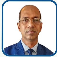
Shri Vijay Mittal Joint Secretary, Ministry of Heavy Industries

Hon'ble Minister of State for Power and New & Renewable Energy