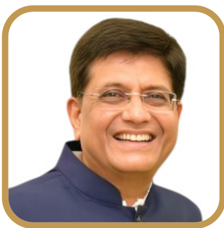
Shri Piyush Goyal Hon'ble Minister of Commerce and Industries