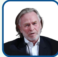
HE Philip Green OAM Australia's High Commissioner to India