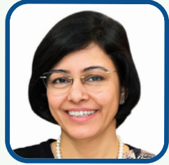
Smt. Ritu Sain IAS, Investment Commissioner, Govt of Chhattisgarh