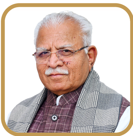
Shri. Manohar Lal Hon'ble Minister of Power and MoHUA