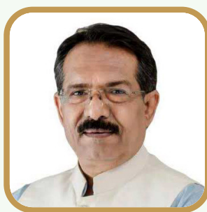
Shri Harsh Malhotra

Hon'ble Minister of State for Road, Transport & Highways and Corporate Affairs