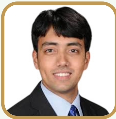
Shri VC Gopal Krishnan Director Automotive and EV, Government of Telangana

Hon'ble Minister of State for Road, Transport & Highways and Corporate Affairs