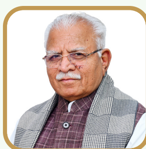
Shri. Manohar Lal