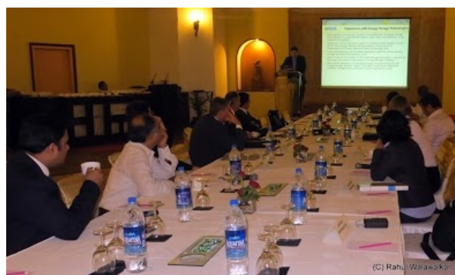
Delegates and the IESA Team at New Delhi