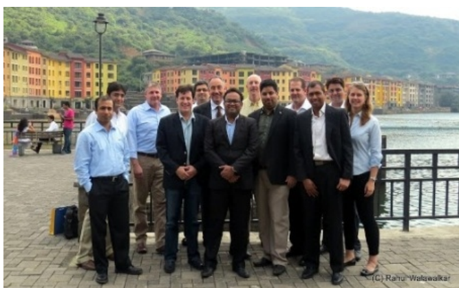
Delegates and the IESA Team at Lavasa

The India Energy Storage Alliance (IESA) has successfully completed its week long maiden technical study tour on Saturday, the 3rd of November, at Lavasa. This tour comprised of delegates in decision making capacities from leading storage technology manufacturers, battery technology integrators and PCS manufacturers, etc., from USA and Australia, and covered Delhi, Mumbai and Lavasa (Pune).