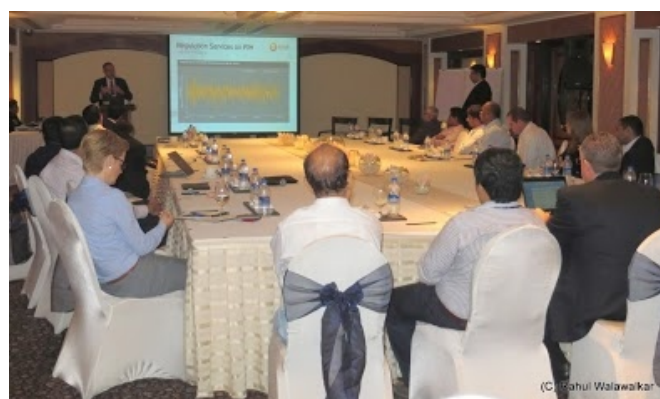
Delegates and the IESA Team at Mumbai

For more information and updates, please visit www.indiaesa.info